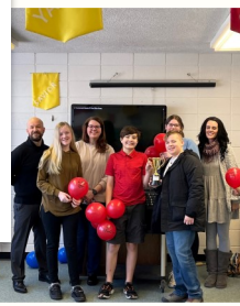
SUNDAY SCHOOL KIDS HAVE FIRST ANNUAL SCRIPTURE SUPER BOWL