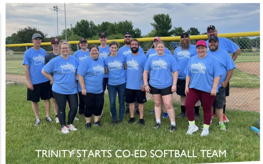
TRINITY STARTS CO-ED SOFTBALL TEAM