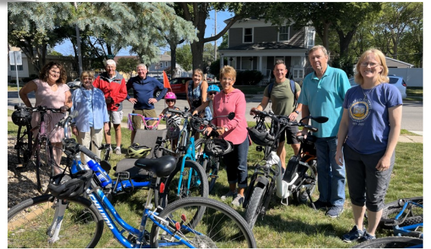
BIKE TO CHURCH SUNDAY