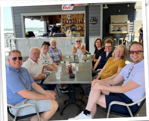
TRINITY STAFF HAD AN AFTERNOON OF RELAXATION AND FUN AT THE LANDING