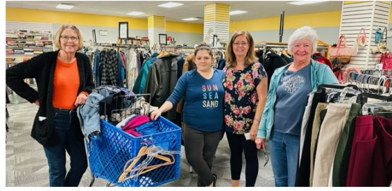
HELPING AT AFFORDABLES IN MASON CITY