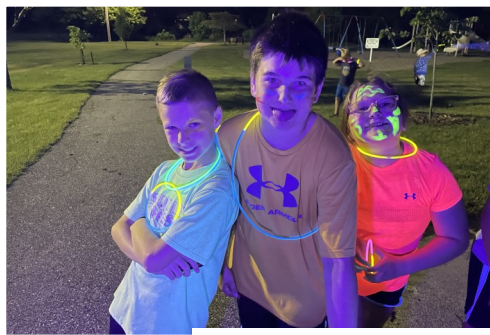
TRINITY'S YOUTH AT MIDDLE SCHOOL GLOW NIGHT