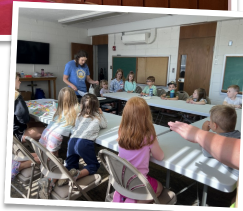
VACATION BIBLE SCHOOL WITH A LITTLE HELP FROM RIVERSIDE BIBLE CAMP COUNSELORS