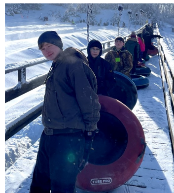
TRINITY YOUTH SNOW TUBING AT MOUNT KATO