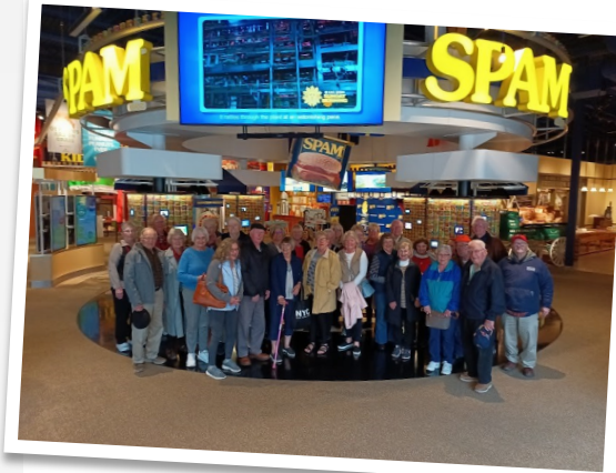
TRINITY TRIPPERS VISIT SPAM MUSEUM

Trinity's always got something going on! The happenings of 2023 included events of faith formation, fellowship, exercise, cooking, learning, and good old-fashioned fun!