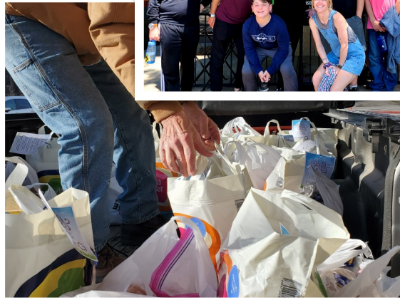
EASTER FOOD BAGS DONATED TO FAMILIES IN NEED