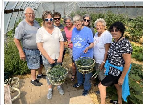
FARM-TO-TABLE COOKING ON ELSBERND FARM