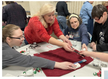
REJOICING SPIRITS SERVICE HELD WITH HOLIDAY ACTIVITIES