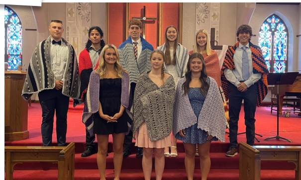
PRAYER SHAWLS GIVEN TO GRADUATING CLASS OF 2023